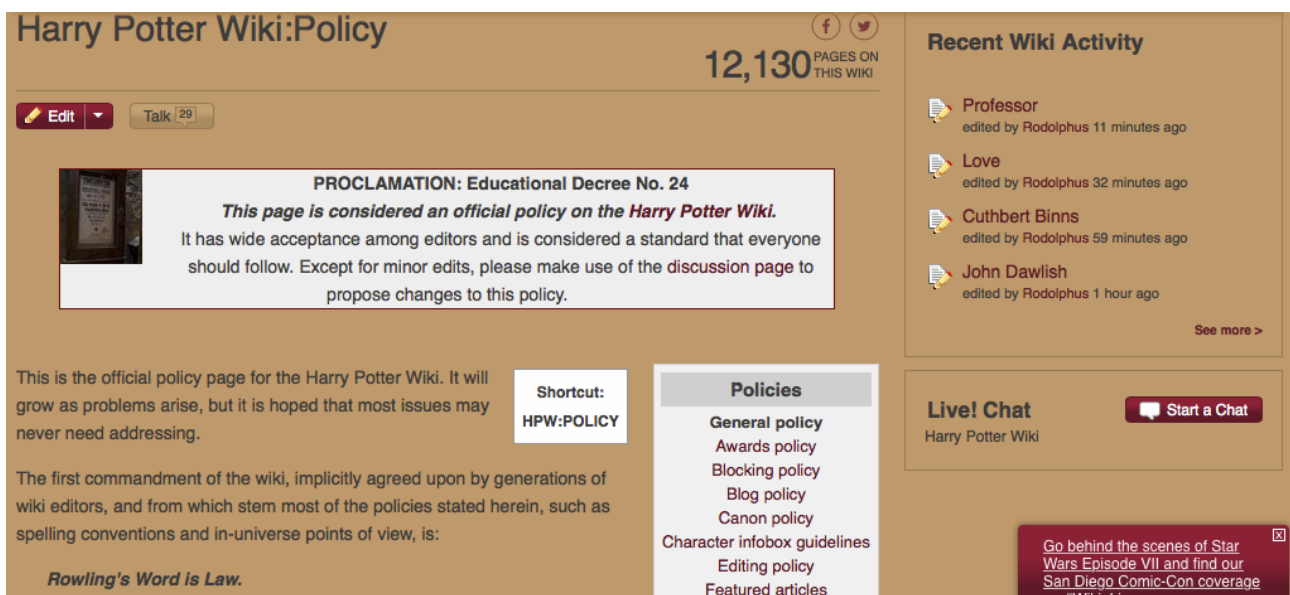
Fig. 3: Harry Potter Wiki policies

“intended to make the Harry Potter function as smoothly as possible” (French version, free translation). All users are required to follow these policies, failing which they will be penalized by wiki administration. If, as we have seen, the writing platform’s structure demands that users make their contributions using a fixed format, these highly rigorous policies go a step further by configuring the very content of these contributions. The number one rule put forth in these Policies has to do with the documentary aim of Wikia: “First and foremost, the Harry Potter Wiki is exactly that—a wiki, or an editable online encyclopedia on the Harry Potter universe. We host information, facts, images, and official theories related to Harry Potter on this site, as well as discussions about the material presented here.”