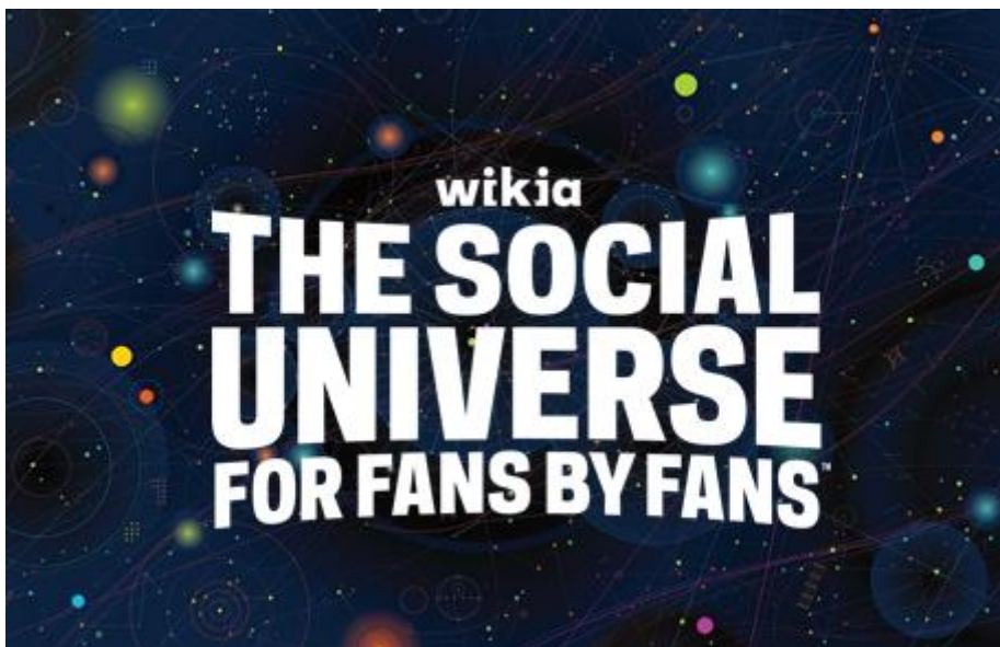
Fig. 1: Wikia slogan

we operate as one.” 2 The media device covers seven pop-culture themes: video games, films, television, comic books, music, books (Wikia Books), and lifestyles.