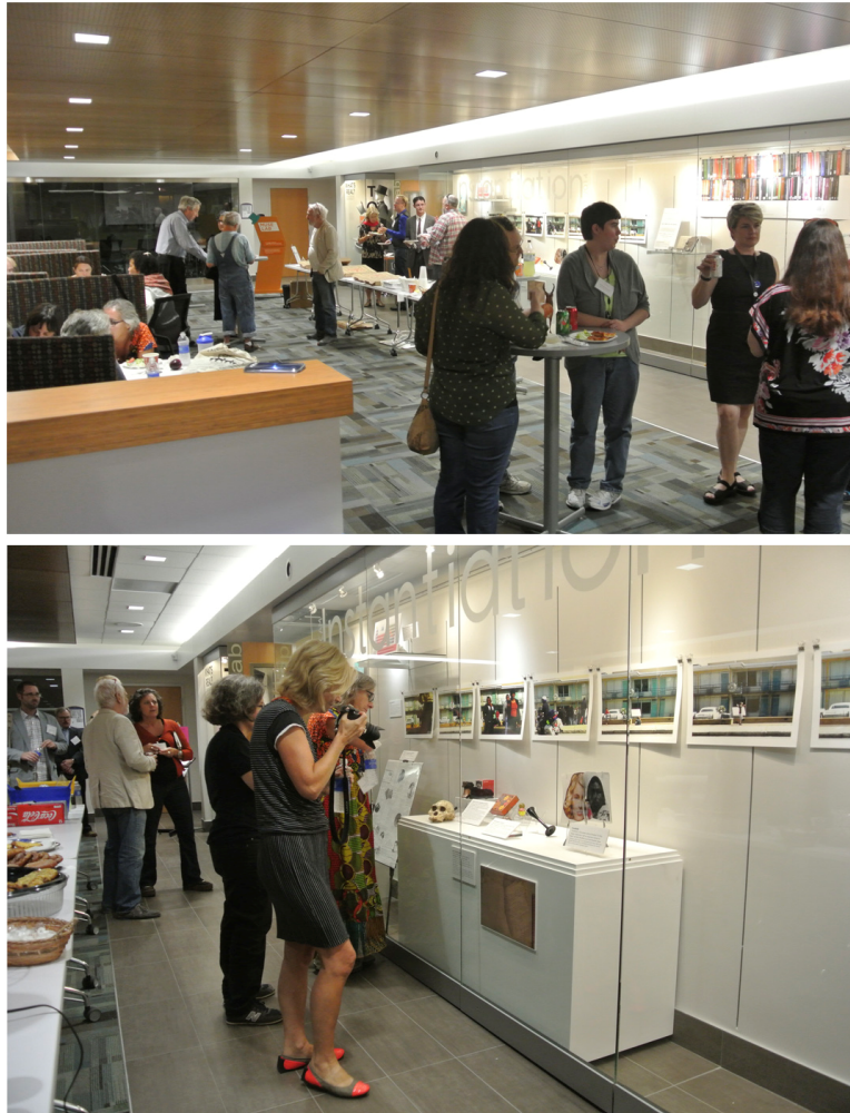
Figure 6: Food, drinks, and comfortable seating were pivotal to creating a conversational space

She anticipated conference participants coming back and forth, from presentations to breaks— sitting, standing, eating, talking—all in front of the Instantiation , allowing multiple opportunities for conversation around the exhibit.