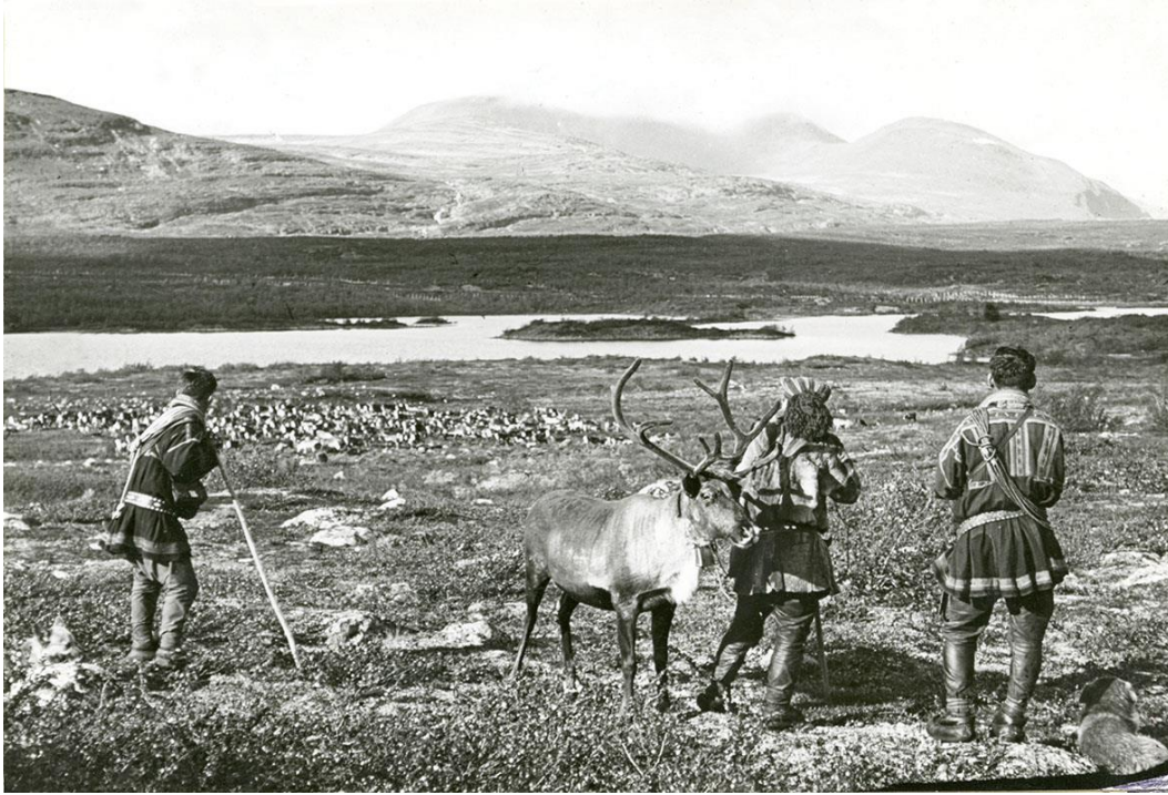
Sámi herders with their reindeer