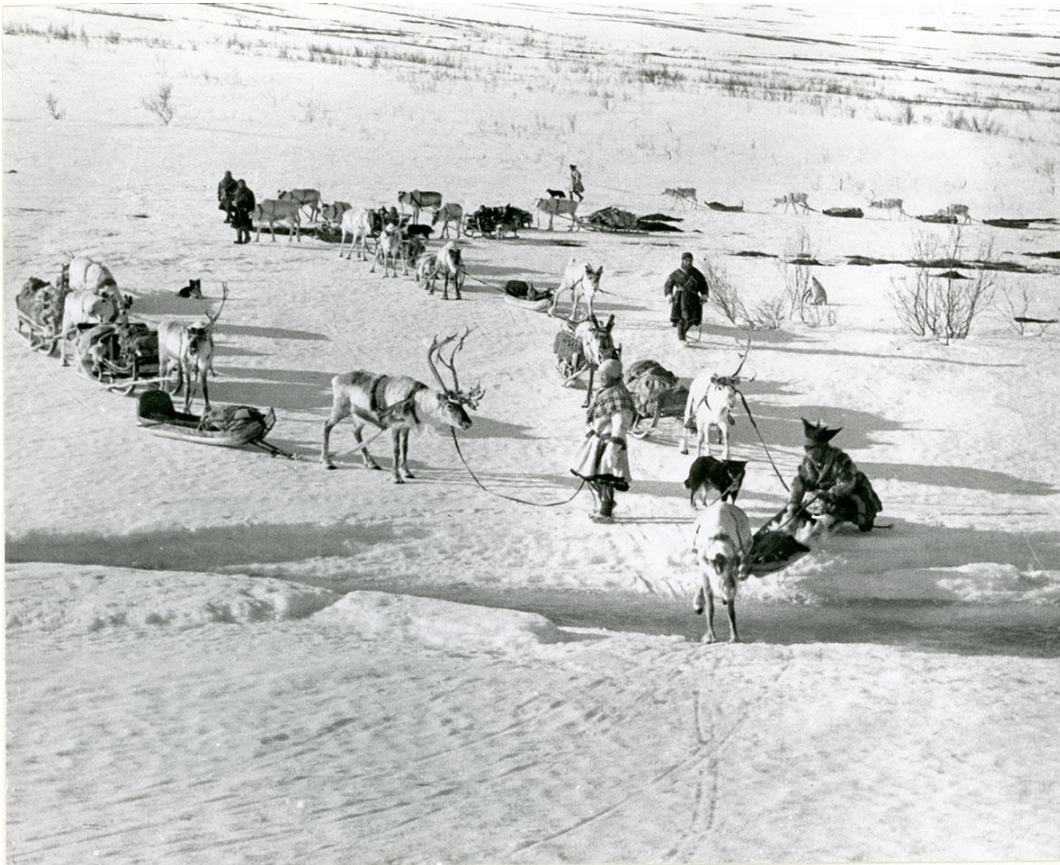
Sámi siida (family unit) moving toward the coast

rivers run, how trees grow a hillside, formations of snow according to wind and temperature – are interpreted by, and forms the behavior of animals and people. Bates calls this first-order information patterns. People living off and close to nature must know how to interpret these patterns. Bates' model is well suited to explain how “natural information”, existing in the material world, becomes “represented information” when interacting with animals and human beings in different ways (2006, p. 1035).