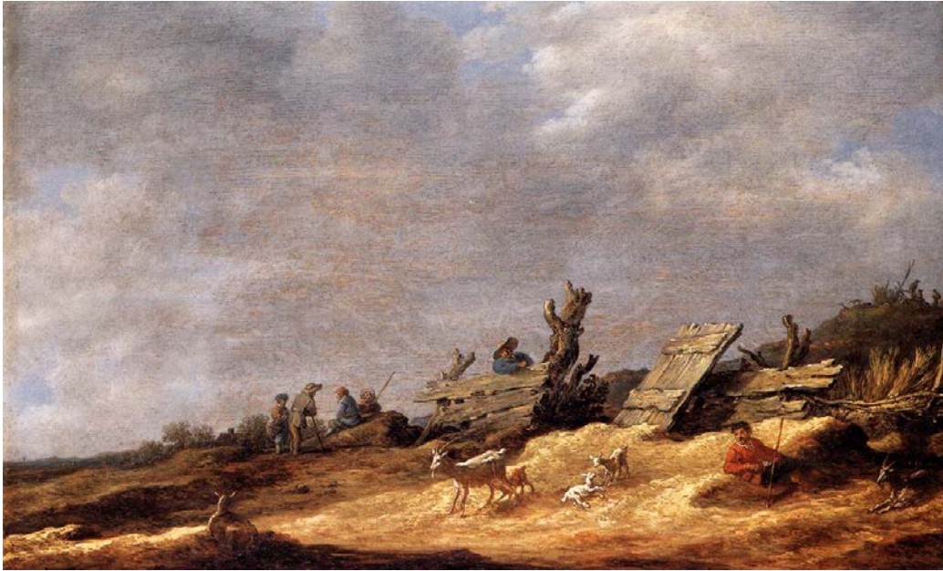
Jan van Goyen, Dune Landscape (1631). Panel of 39.5 x 62.7 cm. Herzog Anton Ulrich-Museum, Braunschweig.

As in many dune landscapes of the period, we see an old, decrepit fence, collapsing onto gnarled tree stumps. A broken door leans against a few planks and leads nowhere in particular. On the left side of the painting sits a group of four people, talking; in the center someone leans with his arm over the fence as if standing at a bar; on the right a goatherd relaxes with his back to his goats--two little ones frisk and frolic in the sun, a few older ones lie half in the shade, and in the center a nanny-goat stands still patiently, while her young kid drinks.