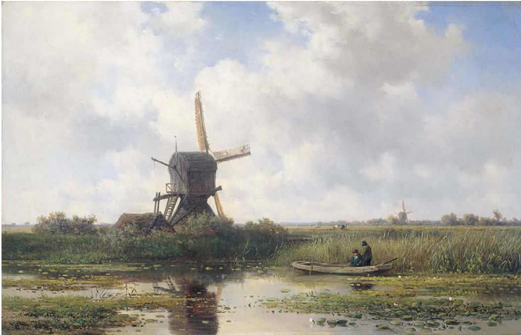
Willem Roelofs (1822–1897) In 't Gein bij Abcoude between 1870 and 1897 in Rijksmuseum Amsterdam

They reacted to the 19th century urbanization and industrialization with a typically pre-19 th century choice of landscapes. Again, painters celebrated a landscape, which was back-grounded, if not occupied, by rather large-scale processes of change, in this case the rise of (sub-) urban and industrial developments. As their 17 th century colleagues had done, they revealed a new cultural imagination and identity formation around landscapes, most clearly expressed in the rise of a “Beauty of our country” sentiment (van Rossem).