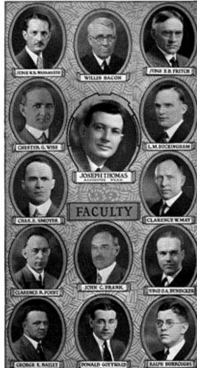
Akron Law School Faculty 1931-36

The Law School was formally incorporated in 1931. 153 In 1933,