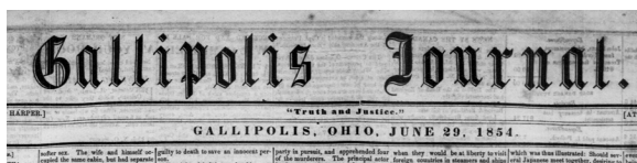
Masthead of the Gallipolis Journal. Ohio History Connection.